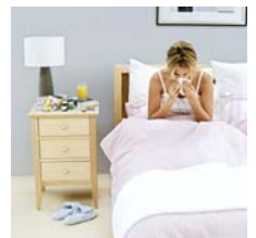
Please help keep our Sick Bank healthy!