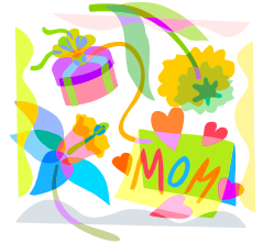
Happy Mothers Day Sunday, May 11th

As we celebrate Mother's Day this year—I celebrate my mother and thank her for all the words of wisdom she has given me!